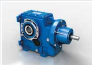
IB With input shaft