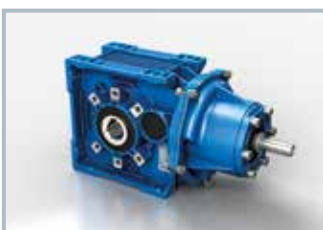
IBA With input shaft