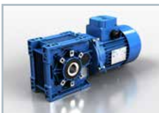
CBA With compact motor