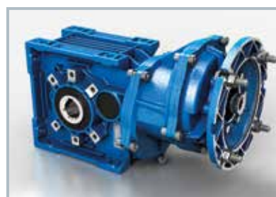
BA.. 3 Stages Foot/Flange Mounting

Different versions are available with hollow output shafts. Single/double solid output shafts are only available for the BA70.