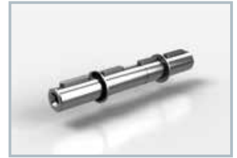
Double Output Shaft