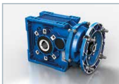
BA.. 2 Stages Foot/Flange Mounting

Different versions are available with hollow output shafts and single/double solid output shafts.