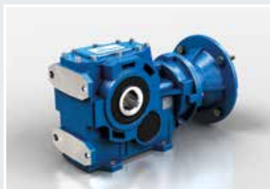
B... FC Foot Mounting