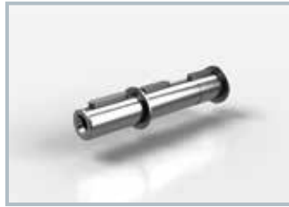
Single Output Shaft