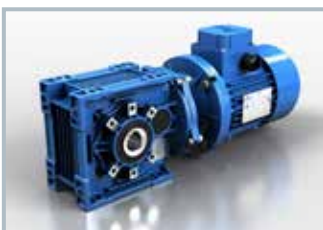
BA Fitted for motor coupling