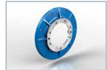
FB - FC - FD