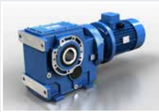
B-PB Fitted for motor coupling - Coupling with flexible coupling

The technological content of B-Series gear reducers allows for an extraordinary performance/lifespan ratio . These highly versatile gear units are successfully used in a vast number of industrial and civil applications. B-Series units offer excellent value for money and output torque/weight ratio , especially considering that they need very limited servicing. The units are available in cast iron (sizes 063 to 163) or aluminium (sizes A42 to A73) casing.