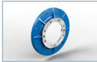
FB - FC